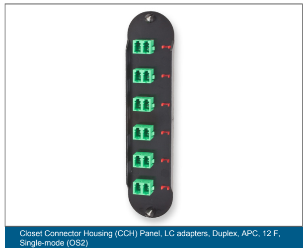
Closet Connector Housing (CCH) Panel, LC adapters, Duplex, APC, 12 F, Single-mode (OS2)