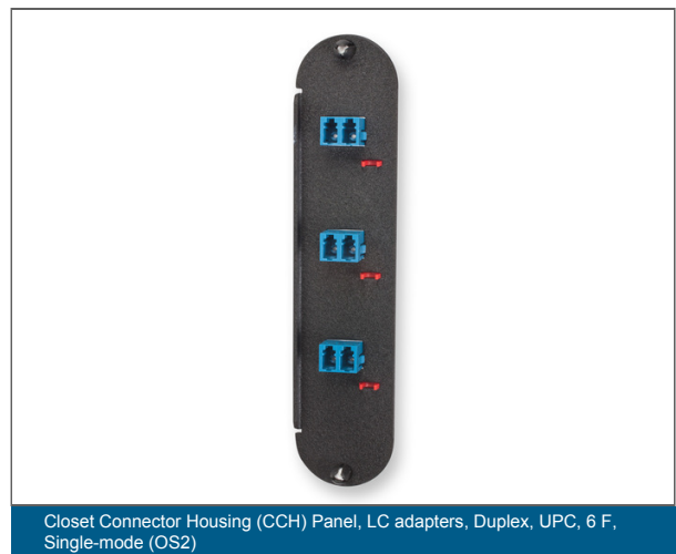
Closet Connector Housing (CCH) Panel, LC adapters, Duplex, UPC, 6 F, Single-mode (OS2)