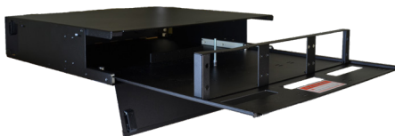
2RU Up to 96 fibers